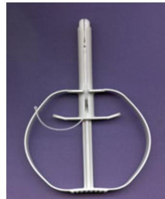
Figure 1. Small ruminant CIDR

Progesterone CIDRs for cattle but not small ruminants are sold in the US. Pfizer Animal Health has obtained a minor species drug designation from the FDA for both the Progesterone EAZI-BREED™ CIDR® Sheep and Goat Inserts which means they would have 7 years of marketing exclusivity upon FDA approval of these CIDRs. Approval has yet to be granted. However, the testing that is required to obtain approval is ongoing. There are other hormonal controls in the form of feed additives (melengestrol acetate is available in Southern States 12% Cattle Pellet from Southern States Cooperative Milling, Gettysburg, PA) and homemade sponges and implants (half of a 6 mg Syncromate cattle implant inserted subcutaneously into underside of tail followed by either a PG600 injection upon removal of